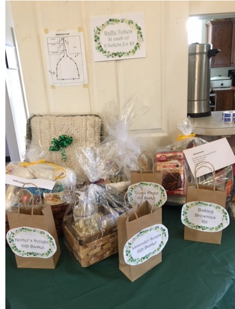
Raffle items that were generously donated by church members